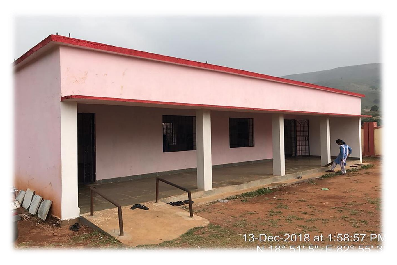
Additional Class rooms at Mundar UPS Dasmantpur Block by SSA