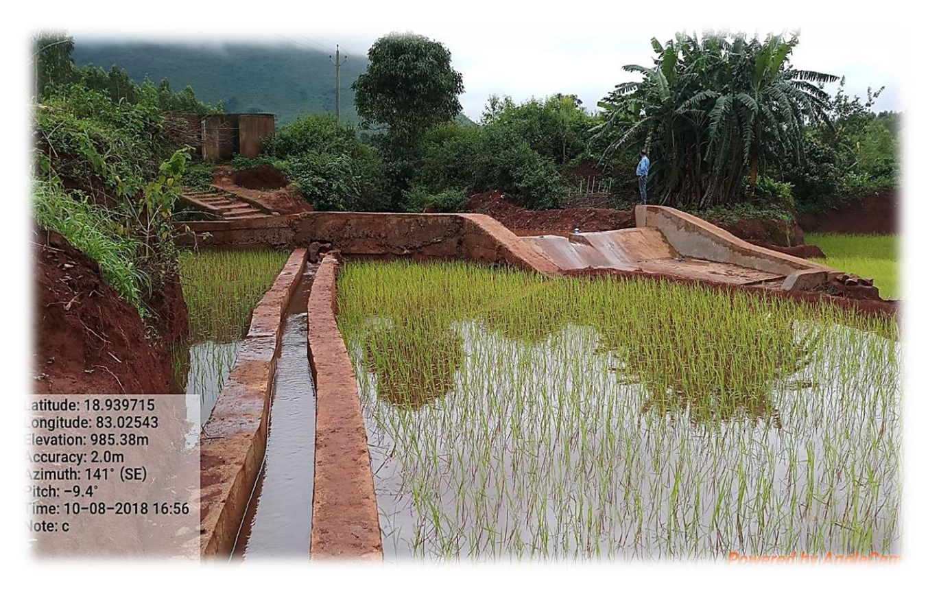
Diversion weir with filed channel at Kudipadar of Laxmipur block by Watershed