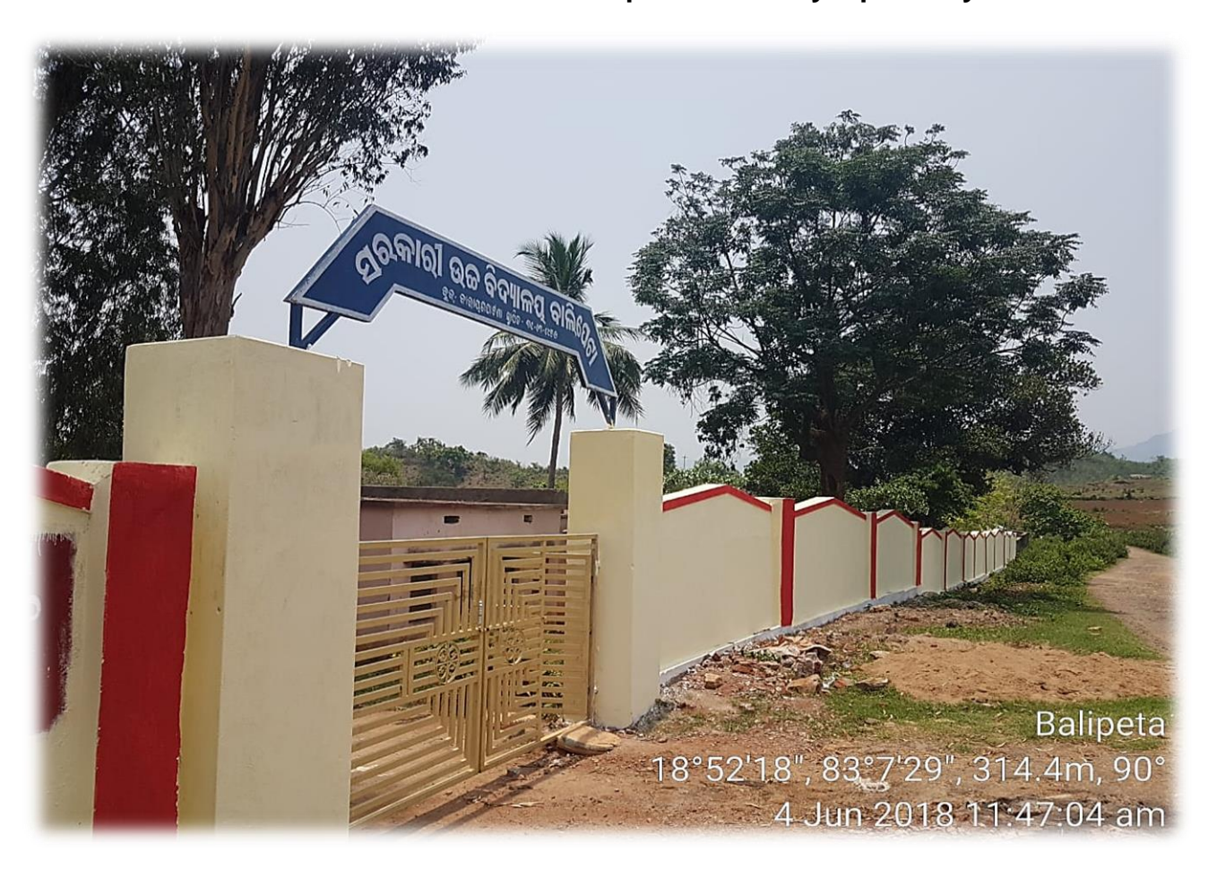
Boundary wall at Balipta PS of Narayanpatna Block by SSA