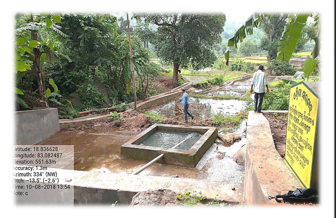
Diversion weir & field channel at Tentulipadar of Narayanpatna by Watershed