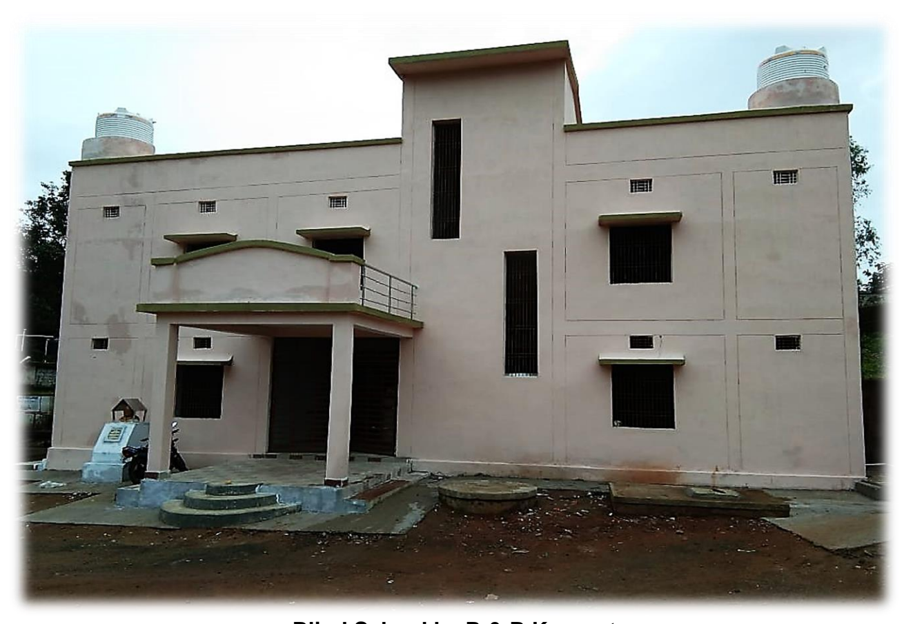
Blind School by R & B Koraput