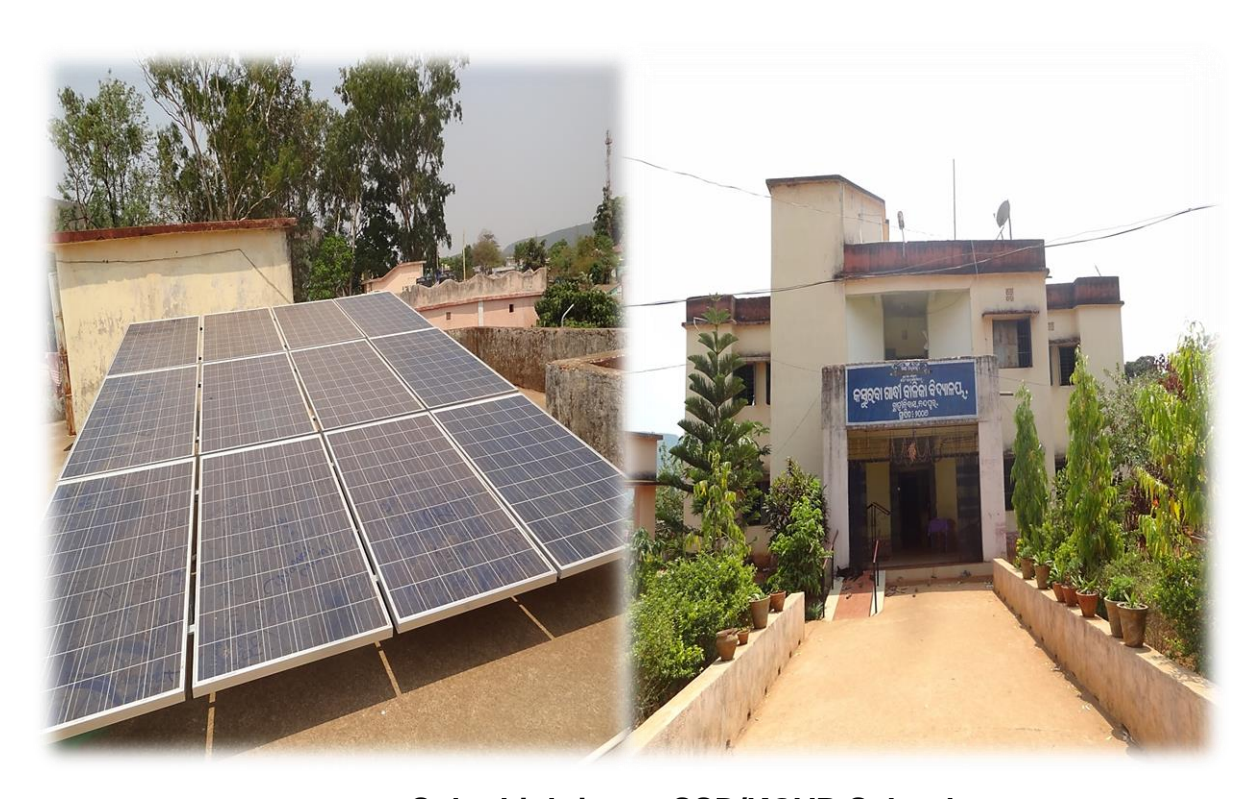
Solar Lighting at SSD/KGVB School