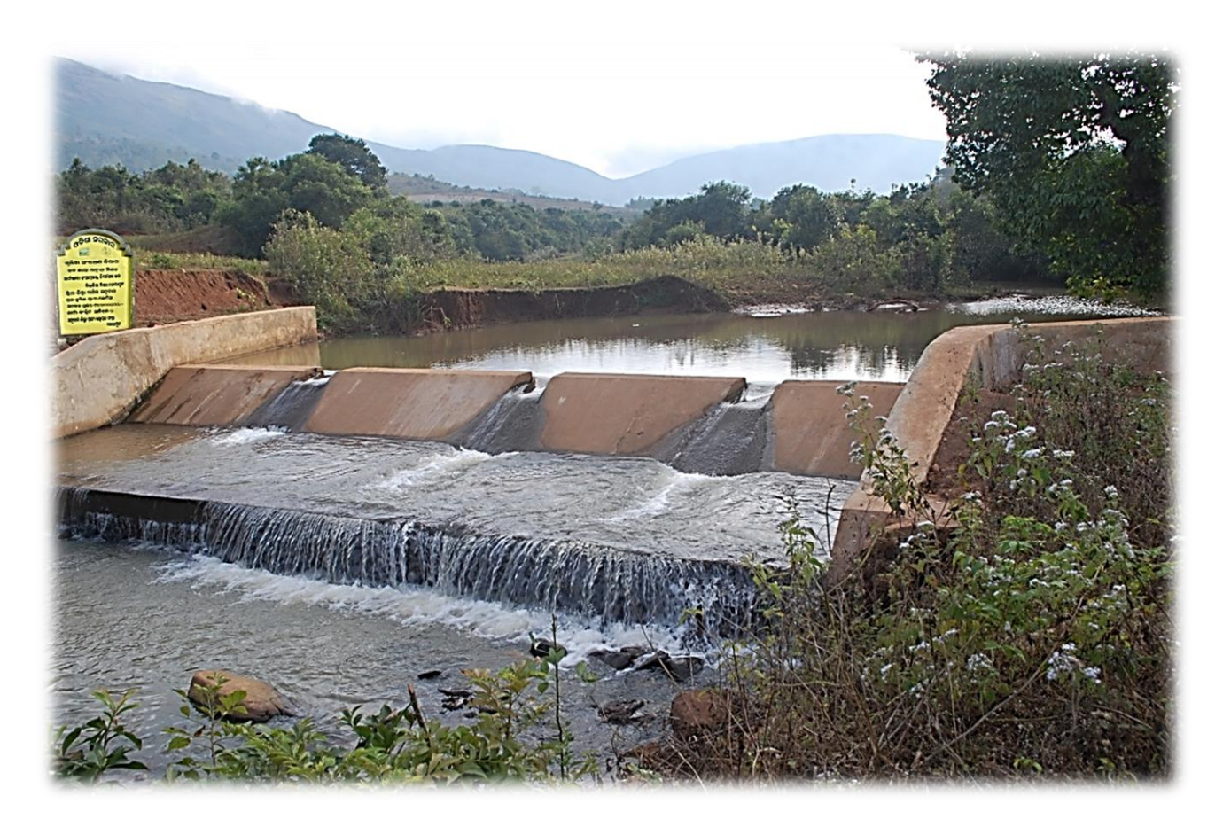
Check Dam at Thuria, G.P: Kotia, Block: Pottangi by Watershed