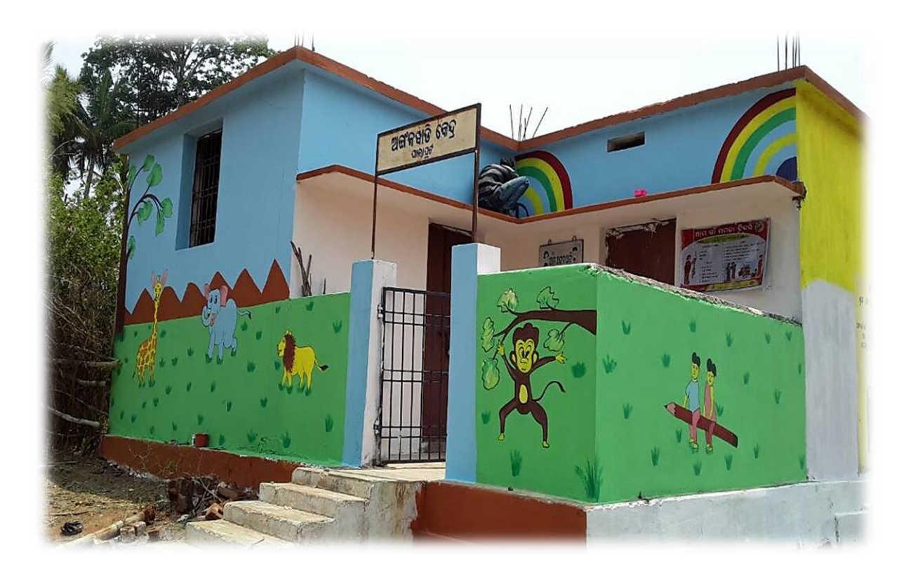
AWC at Palaput by SSA Koraput