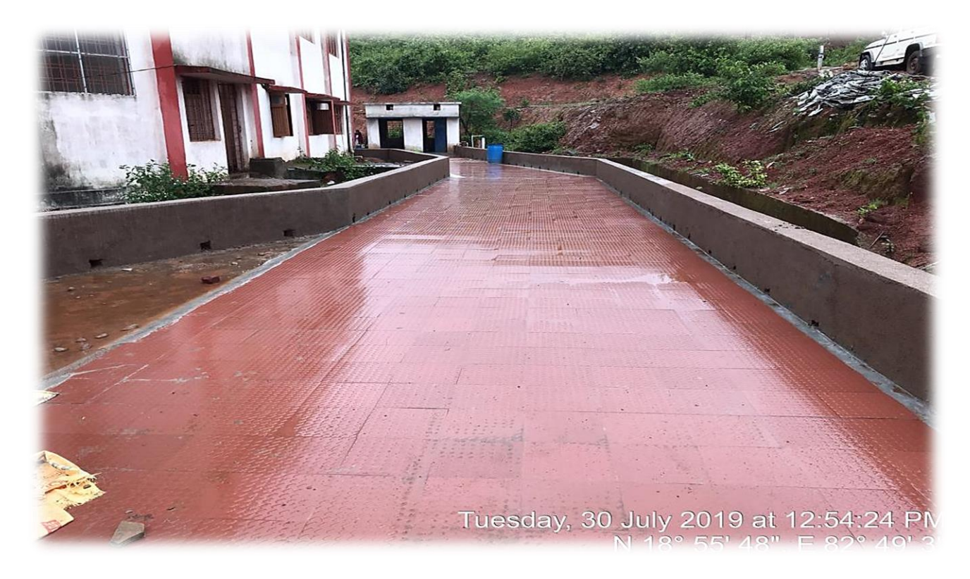
Approach road to Dasmantpur OAV of Dasmantpur Block by SSA