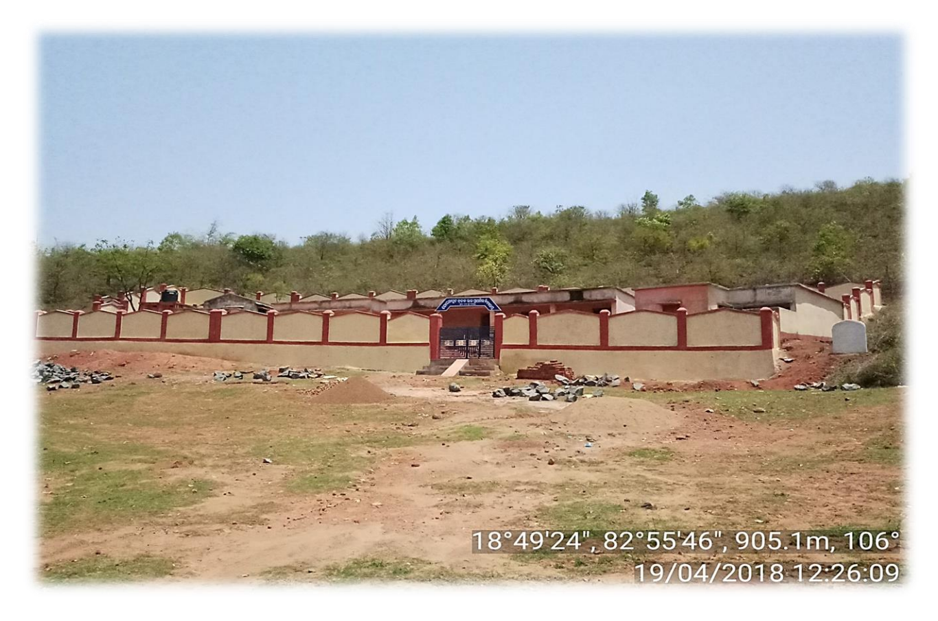
Kankadaput (Boundary Wall), Dasmantpur Block by SSA