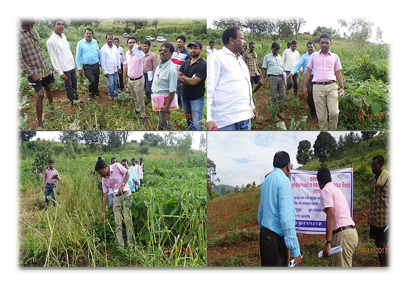
Coffee development by Coffee Development Trust Koraput