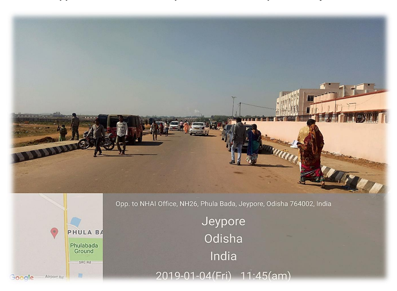
Approach road to DHH Jeypore by R & B Jeypore